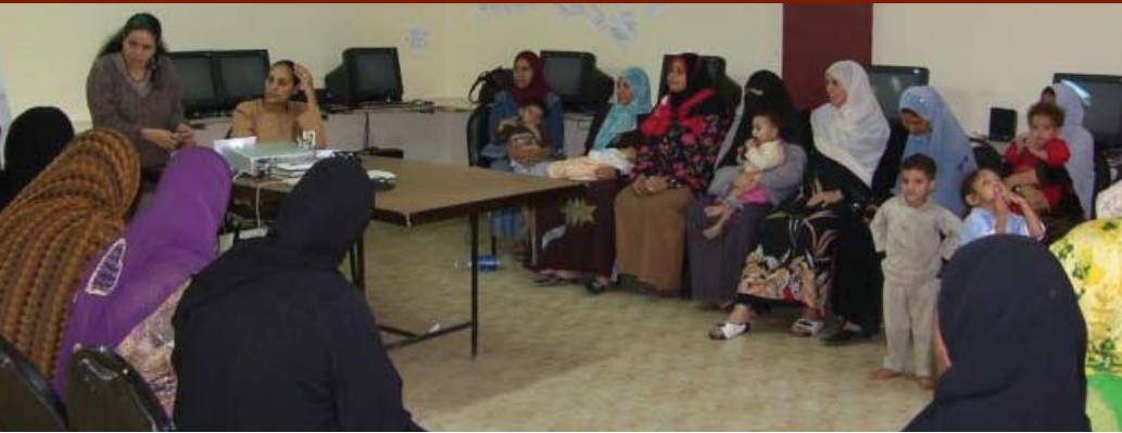
(above) Awareness-raising workshop, Ezbet El-Haggana