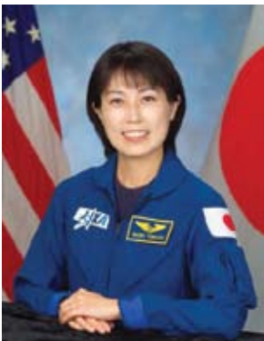
Amelia Earhart Fellow (1994-1995), Naoko Yamazaki

Amelia Earhart Fellow (1994-1995), Naoko Yamazaki , prepares to lift off from Kennedy Space Center for a two-week flight as a Japanese crew member of the Atlantis on 18 March 2010. During this important mission, the Atlantis is to carry equipment and materials to the International Space Station, and Yamazaki will be responsible for operating a robotic arm.