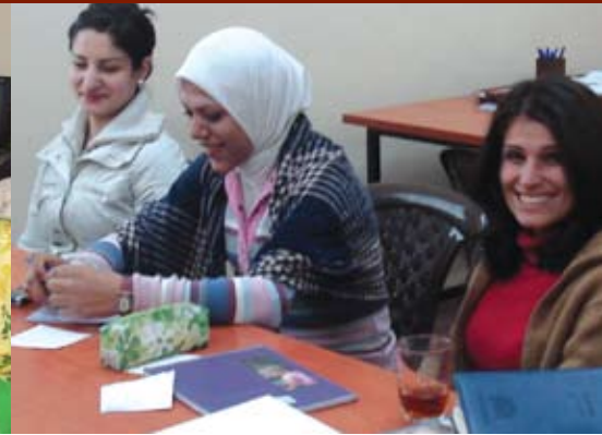
(right) Training workshop with Centre's staff and volunteers