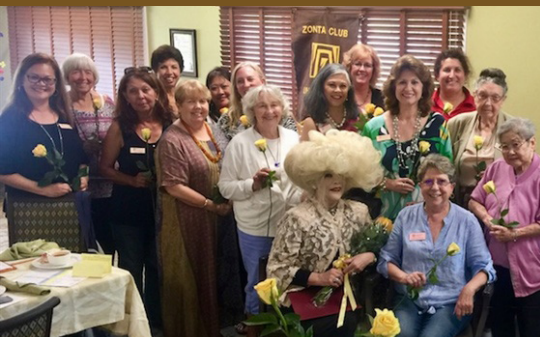
The Zonta Club of Kauai, Hawaii, USA, celebrate Rose Day with each member being presented with a yellow rose.

Thanks to donations made to the Zonta International Foundation, Zontians are able to invest in a future with equal rights for women and girls through the International Service Program (ISP) and Zonta International Strategies to End Violence against Women (ZISVAW) projects, and the education programs that are the core of our mission of empowering women and girls worldwide.