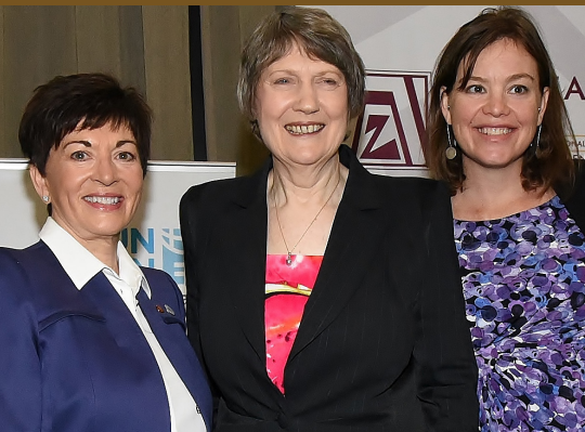
(left to right) Dame Patsy Reddy, the Right Honorable Helen Clark and Honorable Julie Anne Genter at the International Women's Day Breakfast at the New Zealand Parliament hosted by the Zonta Club of Wellington and the UN Women's National Committee of Aotearoa NZ.