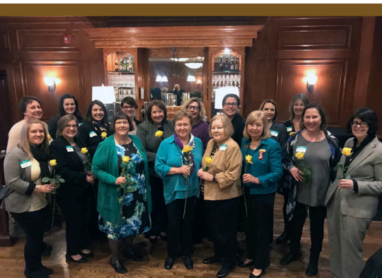
On Rose Day, members of the Zonta International Headquarters team joined the Zonta Club of Oak Brook and the Zonta Club of St. Charles-Geneva-Batavia, Illinois, USA at the Zonta Club of Oak Brook's annual International Women's Day Breakfast.