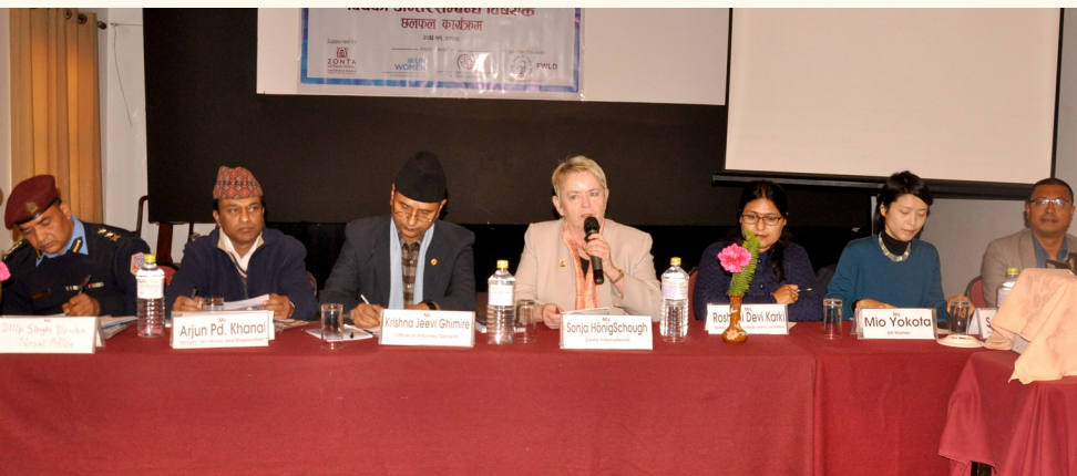
Zonta International President Sonja Höning Schough participates in a roundtable discussion with local policymakers.

We can be proud that our donations are supporting not only women in need, but also creating a sustainable development for women in Nepal, using synergies among all stakeholders.