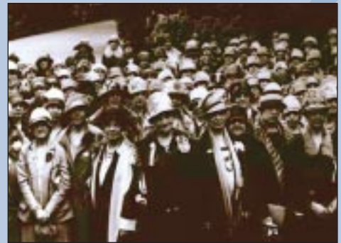
Convention 1927, Washington D.C., USA