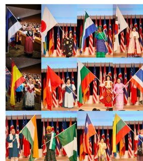
Attendees of the 2022 Zonta International Convention dressed in their traditional clothing for the Flag Parade in Hamburg, Germany.

Zonta spirit is when we empower each other to be our full authentic selves, to speak with respect and to harness our collective minds and hands to elevate our mission. Dear Zontians, you know how important this point is to me.