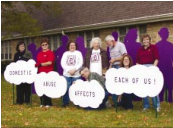
Zonta Club of Madison members set up a display to bring attention to the issue of domestic violence.

violence. In their county, six of the last nine women killed were murdered by boyfriends or husbands. An intimate partner commits 22 percent of the murders of young women aged 16 to 19 in the area. The community's domestic abuse intervention department also presented Club-sponsored adult education about domestic abuse.