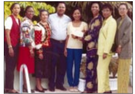
Zonta Club of Nassau members make a contribution to the AIDS Foundation of the Bahamas, which the club started.

In 1992, the Club formed the AIDS Foundation of the Bahamas to provide HIV/AIDS education and