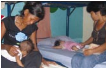
Abused women and their children take refuge in SAGIR, a 24-hour Crisis Response Center founded and operated by the Zonta Club of Muntinlupa & Environs Foundation, Inc.

Following a recent 40-minute sexual abuse prevention class offered at a Muntinlupa City public elementary school by the Zonta Club of Muntinlupa and Environs, a young girl in attendance made a painful confession – her stepfather had been raping her for three years. Unfortunately this type of violence against girls is common; but the admission of it is difficult and often does not emerge quickly enough to stop the abuse in its early stages. The Zonta Club of Muntinlupa is working to change this by providing the sexual abuse prevention classes every week to elementary schools in the city. The classes help students to avoid becoming victims and clearly define actions they should take if they are assaulted.