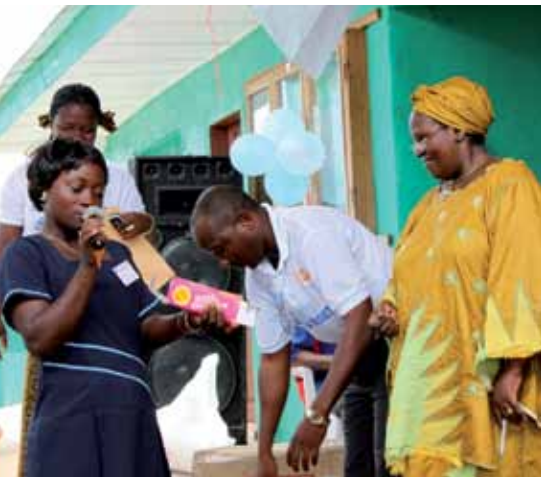
Following completion of the training program, survivors receive a “starter kit” to help them use their newly developed skills to generate income when they return to their communities.

However, as the information about the availability of fistula treatment increases, so too does the demand for services which puts a strain on the existing capacity of facilities and medical personnel to provide the necessary fistula services. Likewise, the rapid growth of the project also requires financial resources that at times are not readily available. To respond to the increase in need in Liberia, the Liberia Fistula Program, with the support of UNFPA and Zonta International, continues to train doctors, nurses and midwives in fistula prevention and treatment. The project is also working closely with partner agencies to ensure continued provision of essential services, while the support of organizations like Zonta International has encouraged new donors to get involved.