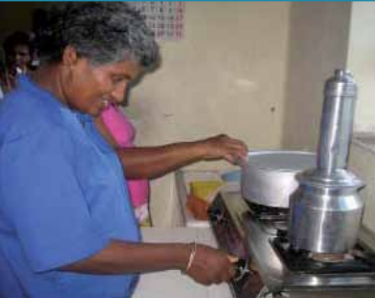
Patients enjoying the new kitchen items

The Z Club and Golden Z Club program is one of Zonta International's longest-running programs. Established in 1948, Z clubs and Golden Z clubs help high school, college and university students develop leadership skills, promote career exploration and encourage members to participate in community, school and international service projects. There are currently 207 Z and Golden Z clubs in 16 countries around the world.