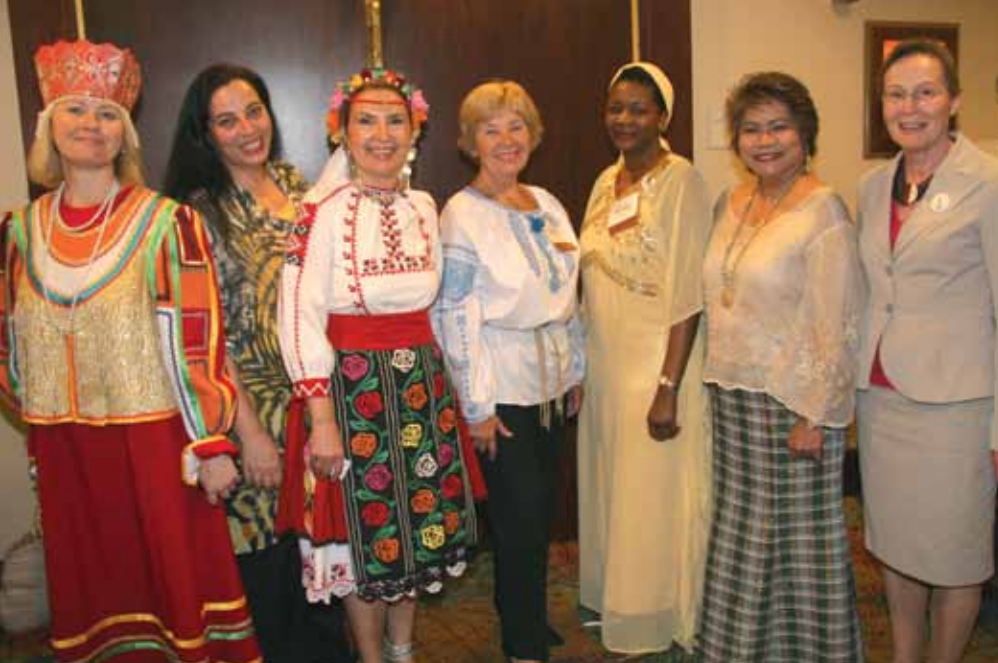
Zontians representing their home countries during the opening ceremony's traditional flag parade.