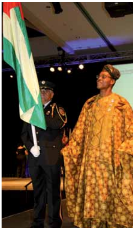
The flag of Togo is presented during the opening ceremony flag parade.

More than 1,400 Zontians, representing all 32 districts, gathered in San Antonio, Texas, USA in June for the 2010 Zonta International Convention. The Convention schedule was filled with informative speakers, important Zonta business, and many opportunities for fun and fellowship. For those of you who were not able to attend the Convention, here is a highlight of the events.