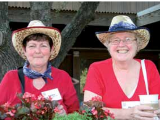
Zontians enjoying Texas-style fun at Knibbe Ranch

Sunday also marked the first day of the business sessions which began with the International President's Report and a report of the International Finance Committee. During the afternoon session, the International Nominating Committee presented the Slate of Candidates for international office. Attendees had the opportunity to meet those Zontians running for office before the elections during the Meet the Candidates event that evening.