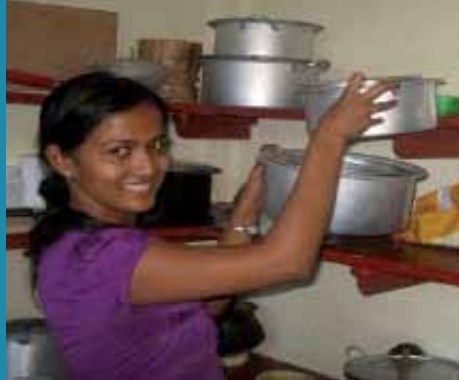
Golden Z Club of Colombo I Member arranging the new kitchen