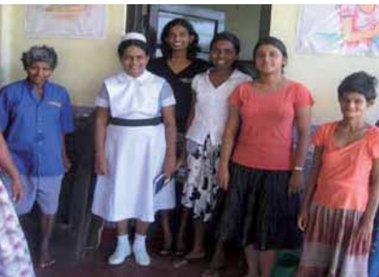
Golden Z members with staff and patients

The Z Club and Golden Z Club program is one of Zonta International's longest-running programs. Established in 1948, Z clubs and Golden Z clubs help high school, college and university students develop leadership skills, promote career exploration and encourage members to participate in community, school and international service projects. There are currently 207 Z and Golden Z clubs in 16 countries around the world.