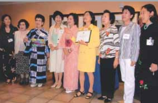
District 26 Zontians sing a song after accepting their award for being one of the top three districts in contributions to the Zonta International Foundation during the 2008-2010 Biennium.

Throughout the convention, Zontians showed their support for Zonta's international service projects and educational programs by visiting the foundation booth and making a donation or donations to the Zonta International Foundation.