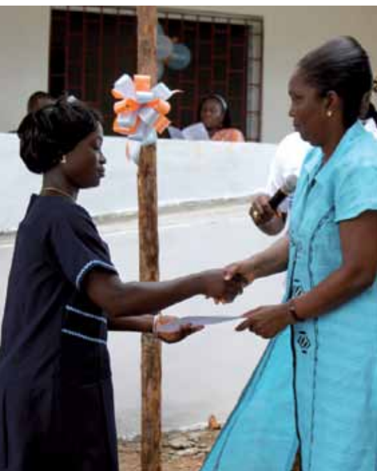
To date, the Fistula Rehabilitation and Reintegration Center has successfully reintegrated 109 survivors since its opening in 2008.

With the support of Zonta International, the fistula project has made significant progress over the last two years in the prevention, treatment and reintegration of survivors of obstetric fistula.