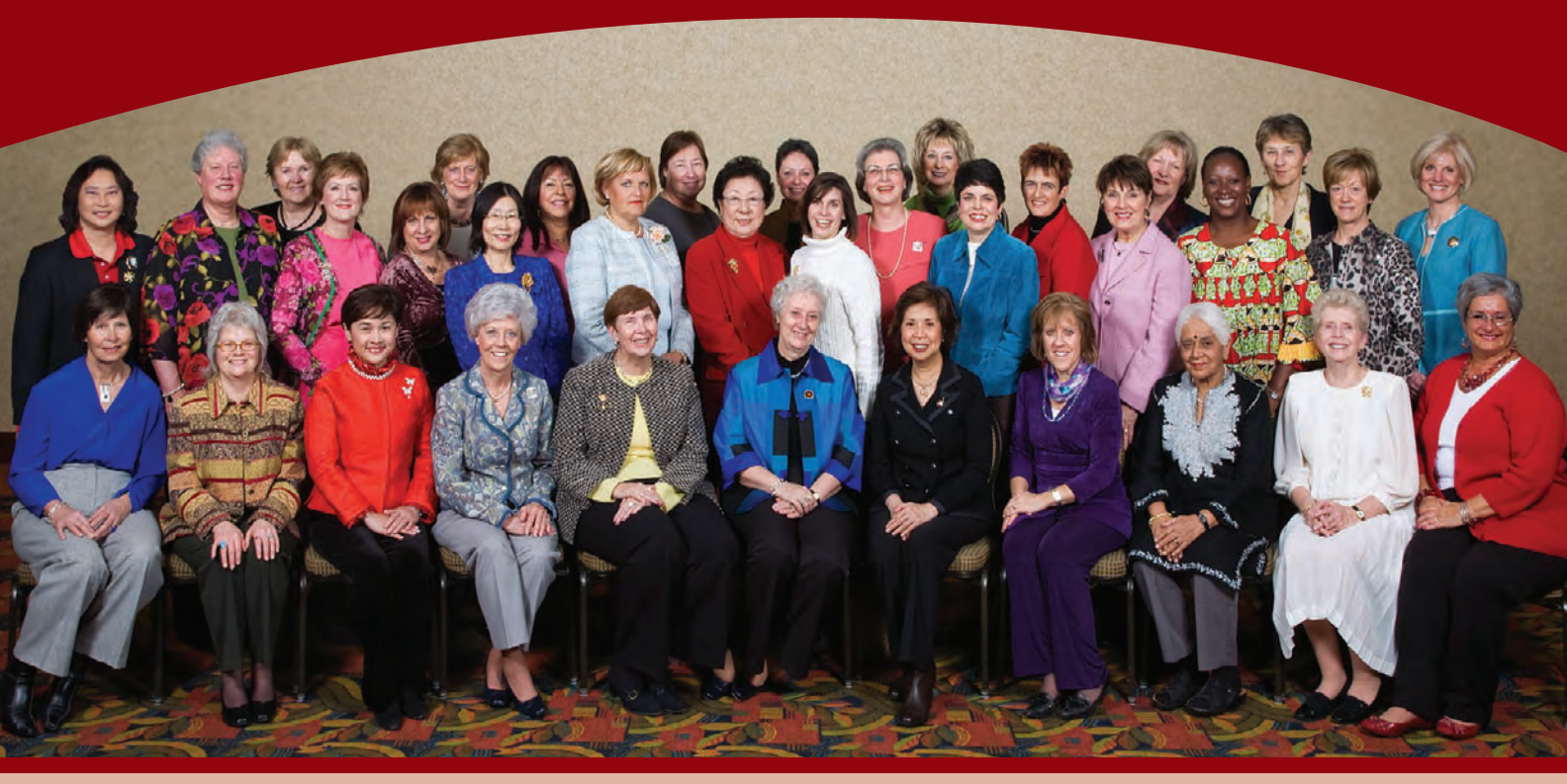
Governor

Governors-Elect, representing 32 Districts, traveled from 17 countries to Zonta International in Chicago, Illinois, USA for Governors-Elect Orientation in February 2008.