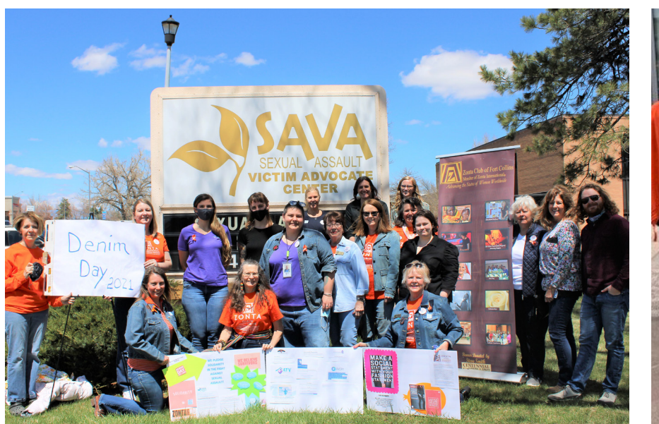
Zonta Club of Fort Collins

In Hong Kong, Zonta clubs are partnering to advocate for legal reforms on sexual offenses, as current laws have been in place for more than 60 years and do not reflect the current realities of sexual harassment that takes place online. The clubs submitted their views and considerations of multiple consultation papers, urging their government and justice department to implement necessary legal reforms. In addition to these advocacy efforts, the Zonta Club of Kowloon collaborated with Harmony House Limited, the first non-governmental organization in Hong Kong committed to ending domestic violence. Club members donated care packages for families at women's