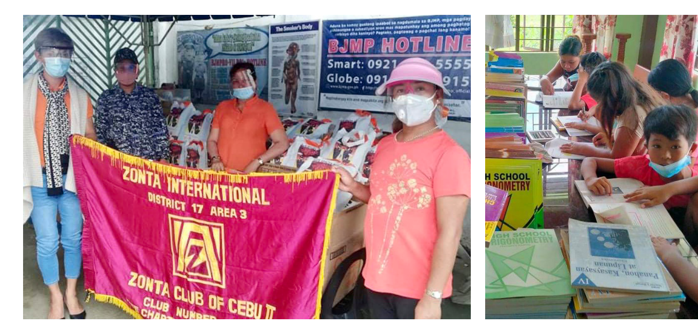
Zonta Club of Dhaka IV

training for 25 women garment workers. The club also organized an advocacy program with the factory workers on gender equality and economic empowerment during the COVID-19 pandemic.