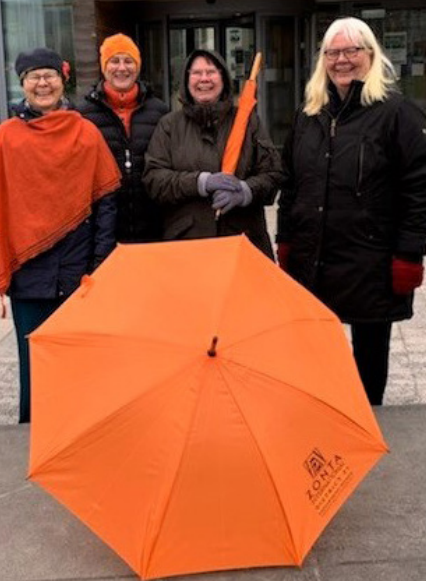
Zonta Club of Kungalv