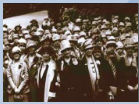
Convention 1927, Washington D.C., USA