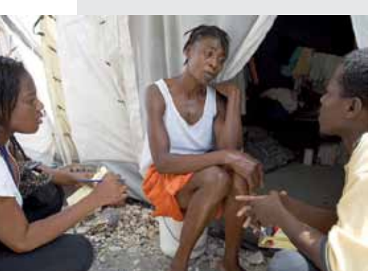
Kay Fanm volunteers meet with a woman in front of her tent in Camp Gheskio.

The second ZISVAW project for the current biennium is UN Women's 'Security and Empowerment for Women and their Families: Ensuring a Gender-Responsive Humanitarian and Early Recovery Response in Haiti.' As a result of the January 2010 earthquake, Kay Fanm, one of the oldest women's organizations combating gender-based violence (GBV) and providing services to survivors in Haiti, incurred extensive damages, including loss of its building which housed shelters for adolescent and women survivors of violence. Although Kay Fanm continued to provide medical care, psychological assistance, mediation services and legal assistance for women and girls in the aftermath of the earthquake, the organization was not able to provide temporary shelter for victims of sexual or domestic violence.