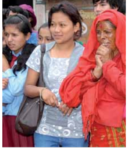
Nepalese burns violence survivor engaging in community outreach