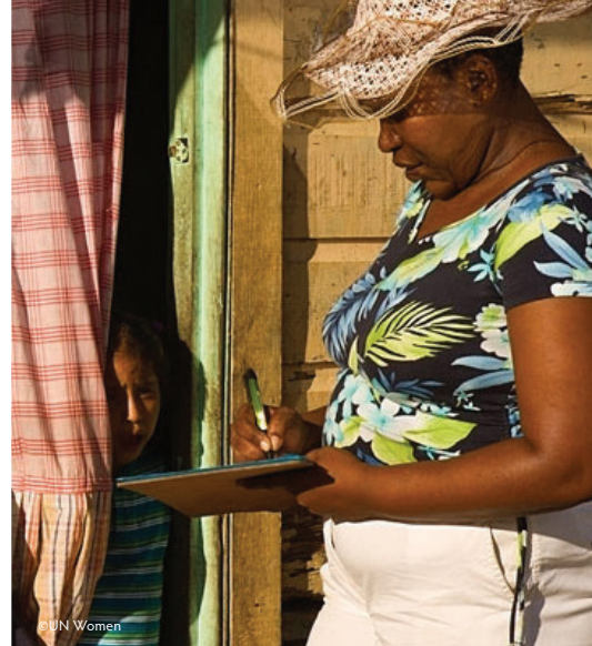
Left: Zonta supported the Liberia Fistula Project which helped women reintegrate into their communities.