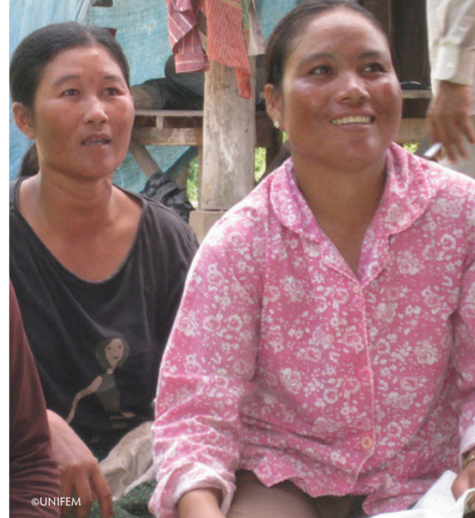
Left: The ending child marriage project has the potential to reach 2.5 million girls.