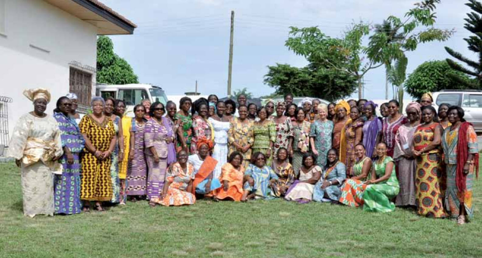
Zontians gathered during a trip to Amanokrom, Akuapem