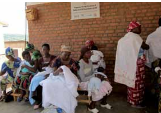
Zonta International-Sponsored Health Clinic in Rwanda

The Government of Rwanda is aiming to eliminate mother to child transmission of HIV/AIDS by 2015 and, with support from Zonta International, UNICEF is taking steps toward making this goal a reality. Remarkable progress has already been made over the past years in services for pregnant women, their male partners and HIV-exposed children. Zonta International's support for UNICEF's Prevention of Mother to Child Transmission (PMTCT) of HIV/AIDS and the Prevention of Gender-Based Violence in Rwanda started in 2008. To date, Zonta International's