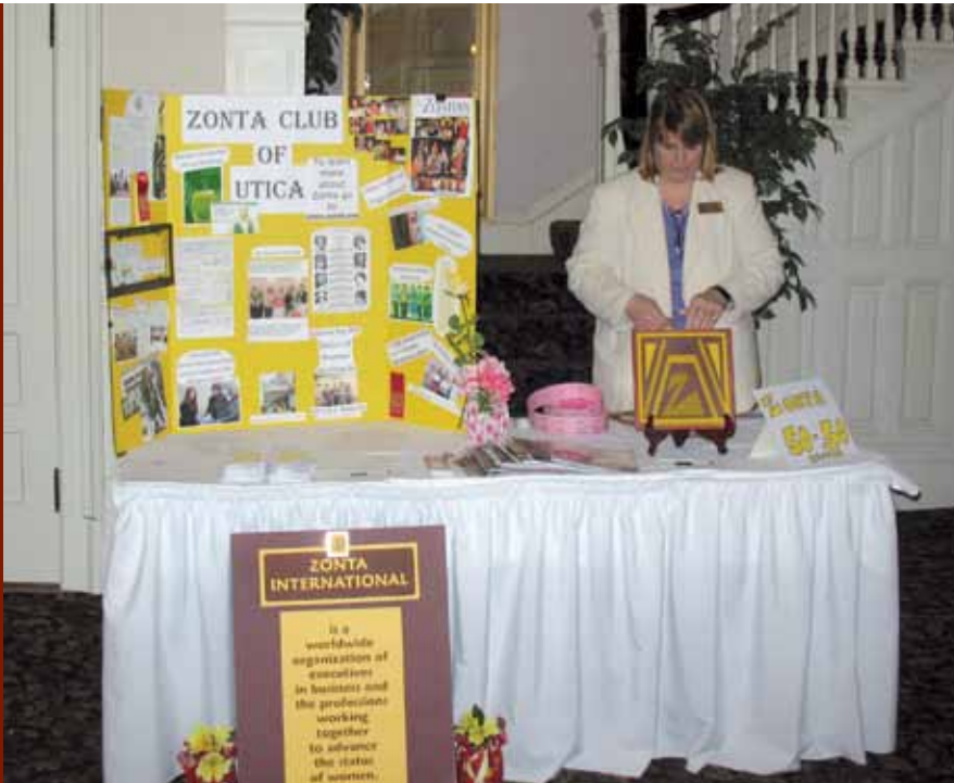
A member of the Zonta Club of Utica sets up a table at an event to share information with prospective members