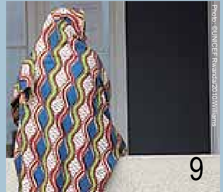
A local woman outside the Isange One Stop Centre in Kigali, Rwanda