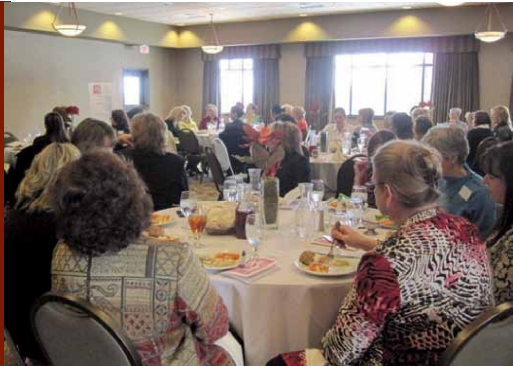
Members of the Zonta Club of Black Hills in South Dakota at a monthly meeting

events on community calendars; and, at each event where the club has a presence, they welcome people to sign up for more information. The club also holds the annual Glass Slipper Ball and a membership outreach evening where prospective members are introduced to the club through service projects.