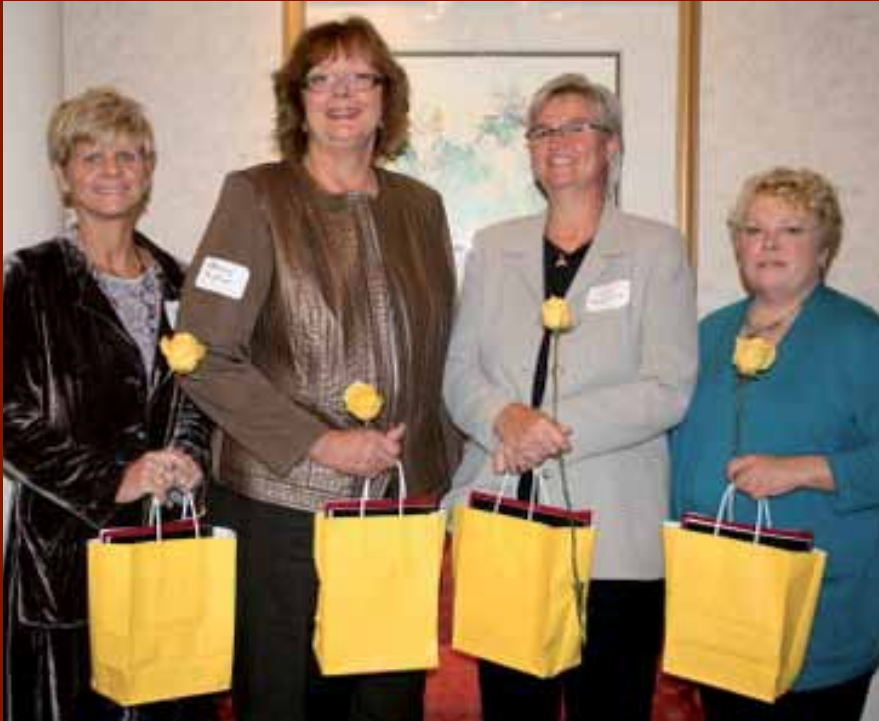
New members of the Zonta Club of Columbus pose after a recent induction ceremony

highlights Zonta's mission, service and advocacy and serves as a resource to recruit new members.