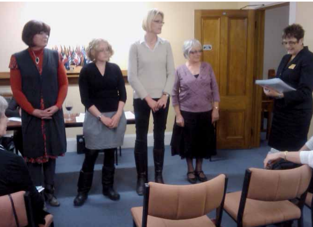
The Zonta Club of Manawatu puts renewed emphasis on membership.