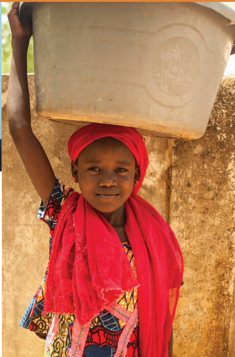
Above photo: What Took You So Long? Cover, left and top right: What Took You So Long?